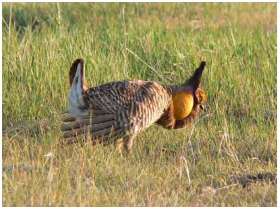
Greater prairie chicken.

To the extent that a federal nexus with a wind project exists, for example, developing a project on federal lands or obtaining a federal permit, the lead federal action agency should make its decision based in part on a developer's commitment to mitigate adverse environmental impacts. The federal action agency should ensure that the developer adheres to those commitments, monitors how they are implemented, and monitors the effectiveness of the mitigation. Additionally, the lead federal action agency should make information on mitigation monitoring available to the public through its web site;