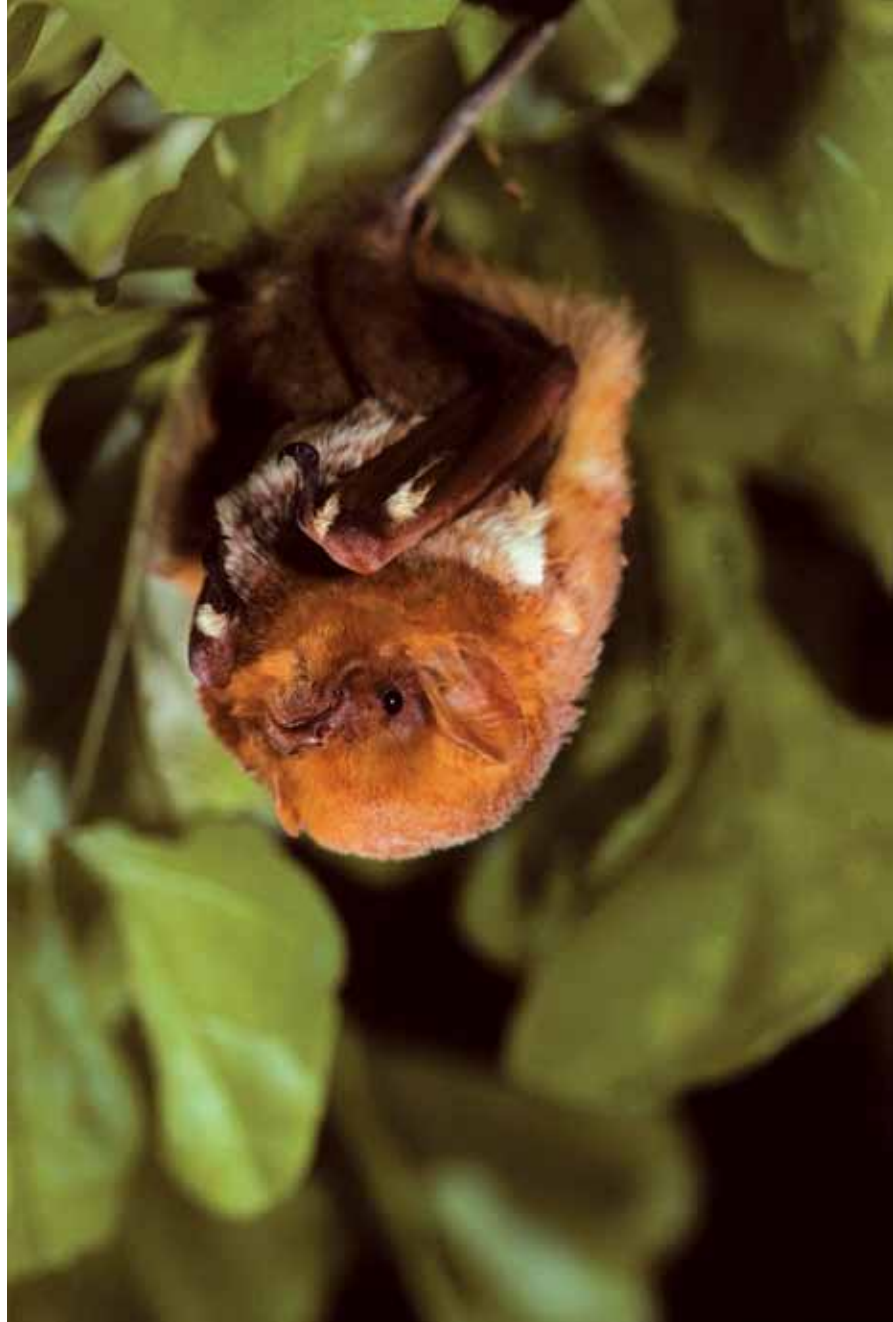
A male Eastern red bat perches among green foliage.

Fatality monitoring should occur over all seasons of occupancy for the species being monitored, based on information produced in previous tiers. The number of seasons and total length of the monitoring may be determined separately for bats and birds, depending on the pre-construction risk assessment, results of Tier 3 studies and Tier 4 monitoring from comparable sites (see Glossary in Appendix A) and