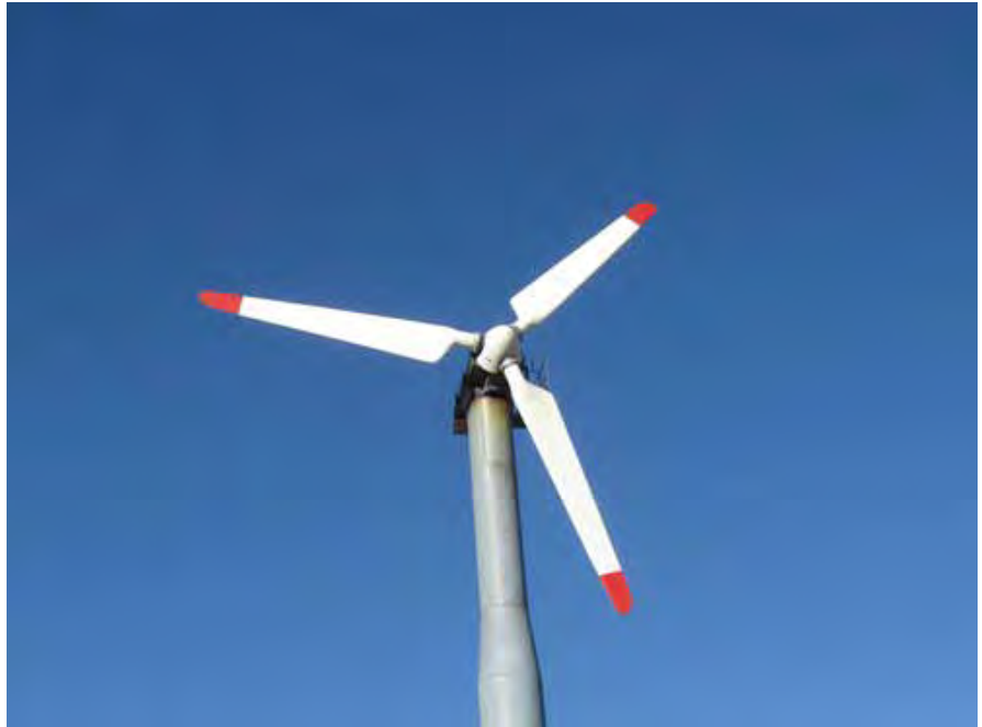
Wind turbine in California.. Credit: NREL

Federally-recognized Indian Tribes enjoy a unique government-to-government relationship with the United States. The United States Fish and Wildlife Service (Service) recognizes Indian tribal governments as the authoritative voice regarding the management of