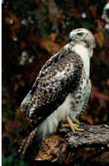
Red-tailed hawk.

An estimate of raptor use of the project site is obtained through appropriate surveys, but if potential impacts to breeding raptors are a concern on a project, raptor nest searches are also recommended. These surveys provide information to predict risk to the local breeding population of raptors, for micro-siting decisions, and for developing an appropriate-sized non-disturbance buffer around nests. Surveys also provide baseline data for estimating impacts and determining mitigation