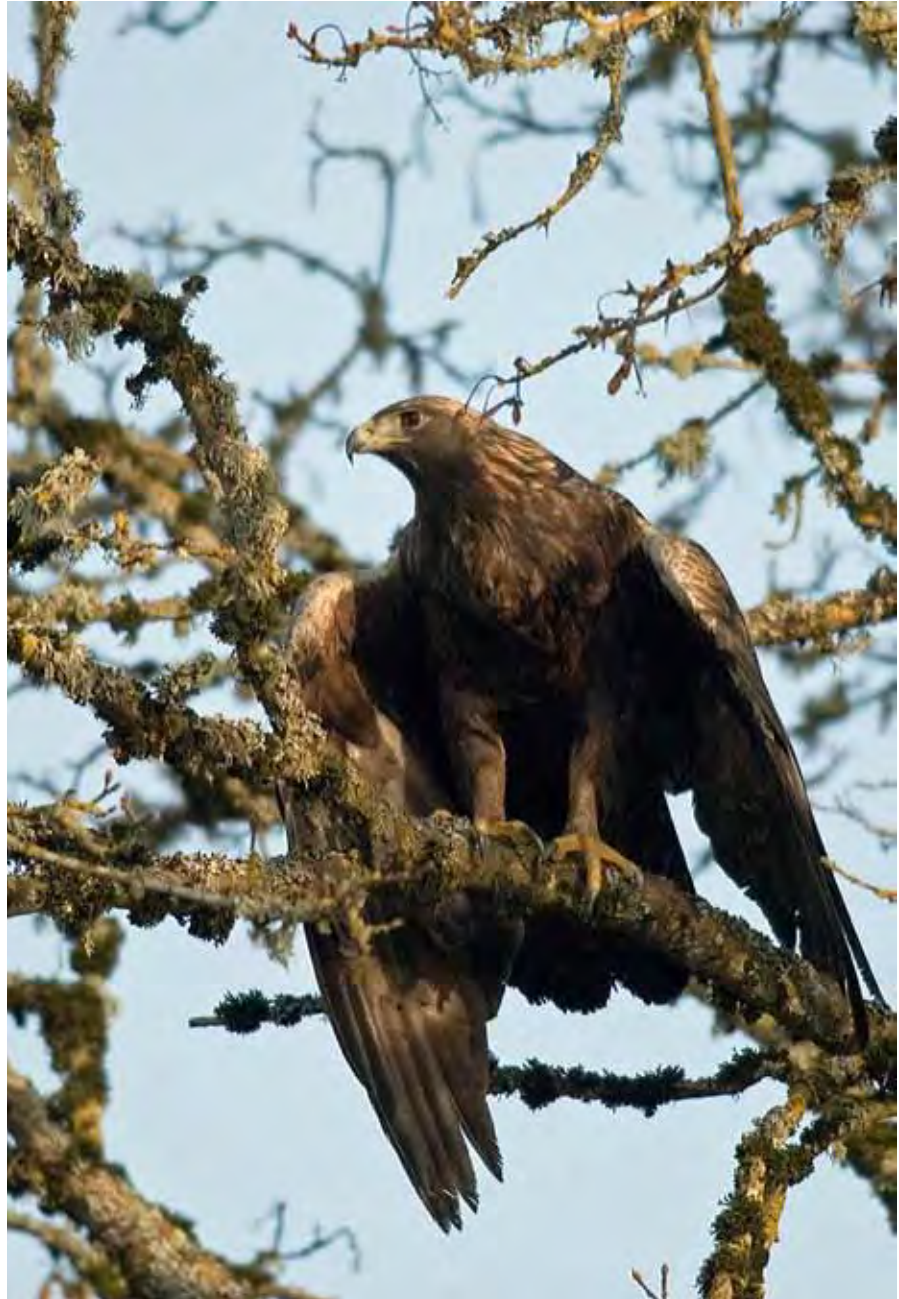
Golden eagle.

by the project, or lost due to various types of mortality including collisions with turbine blades.