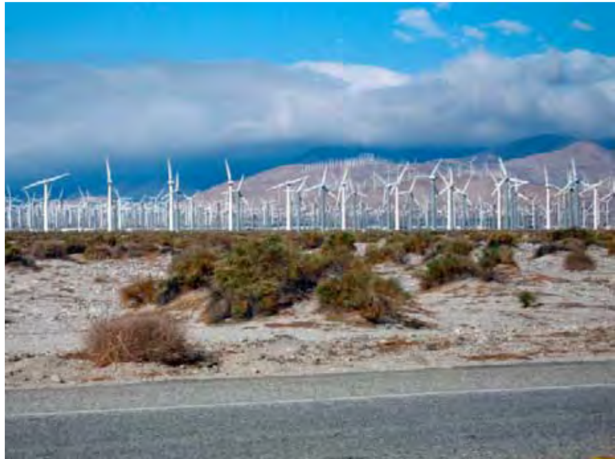
Rows of wind turbines.

Specific study designs will vary from site to site and should be adjusted to the circumstances of individual projects. Study designs will depend on the types of questions, the specific project, and practical considerations. The most common considerations