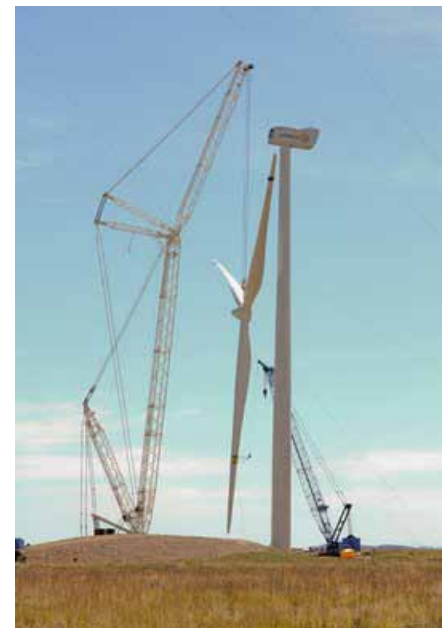
Towers are being lifted as work continues on the 2 MW Gamesa wind turbine that is being installed at the NWTC.