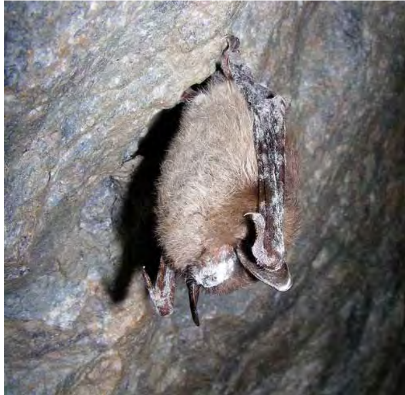
Little brown bat with white nose syndrome.