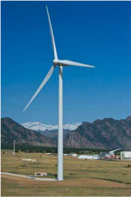
Wind turbine.

projects in similar conditions within the same region are recommended as a basis for determining needed sample size (see Morrison et al., 2008). If data are not available, the Service recommends that an operator select a sufficient number of turbines via a systematic sample with a random start point. Sampling plans can be varied (e.g., rotating panels [McDonald 2003, Fuller 1999, Breidt and Fuller 1999, and Urquhart et al. 1998]) to increase efficiency as long as a probability sampling approach is used. If the project contains fewer than 10 turbines, the Service recommends that all turbines in the area of interest be searched unless otherwise agreed to by the permitting or wildlife resource agencies. When selecting turbines, the Service recommends that a systematic sample with a random start be used when selecting search plots to ensure interspersed among turbines. Stratification among different habitat types also is recommended to account for differences in fatality rates among different habitats (e.g., grass versus cropland or forest); a sufficient number of turbines should be sampled in each strata.