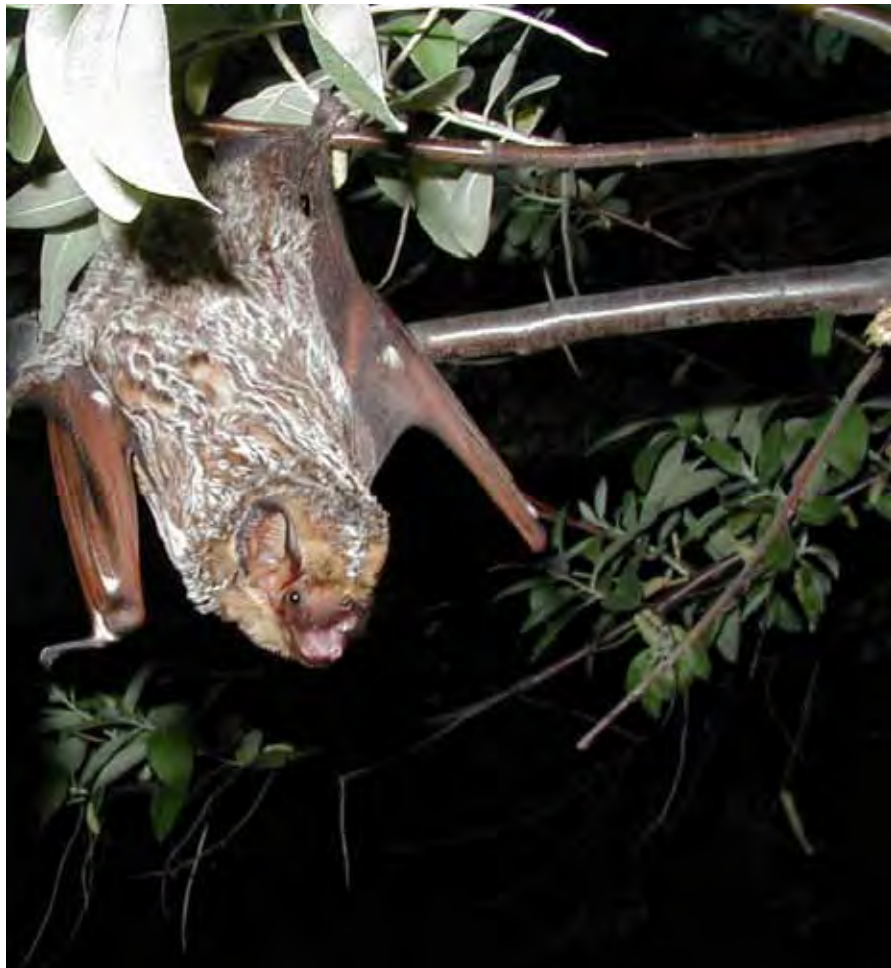
Hoary bat.

The commonly used data collection methods for estimating the spatial distribution and relative abundance of diurnal birds includes counts of birds seen or heard at specific survey points (point count), along transects (transect surveys), and observational studies. Both methods result in estimates of bird use, which are assumed to be indices of abundance in the area surveyed. Absolute abundance is difficult to determine for most species and is not necessary to evaluate species risk. Depending on the characteristics of the area of interest and the bird species potentially affected by the project, additional pre-construction study methods may be necessary. Point counts or line transects should collect vertical as well as horizontal data to identify