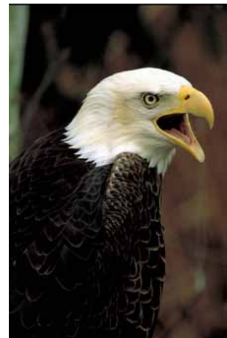
Bald eagle.

The ESA has provisions that allow for compensation through the issuance of an Incidental Take Permit (ITP). Under the ESA, mitigation measures are determined on a case by case basis, and are based on the needs of the species and the types of effects anticipated. If a federal nexus exists, or if a developer chooses to seek an ITP under the ESA, then effects to listed species need to be evaluated through the Section 7 and/or Section 10 processes. If an ITP is requested, it and the associated HCP must provide for minimization and mitigation to the maximum extent practicable, in addition to meeting other necessary criteria for permit issuance. For further information about compensation under federal laws administered by the Service, see the Service’s Habitat and Resource Conservation website http://www.fws.gov/habitatconservation .