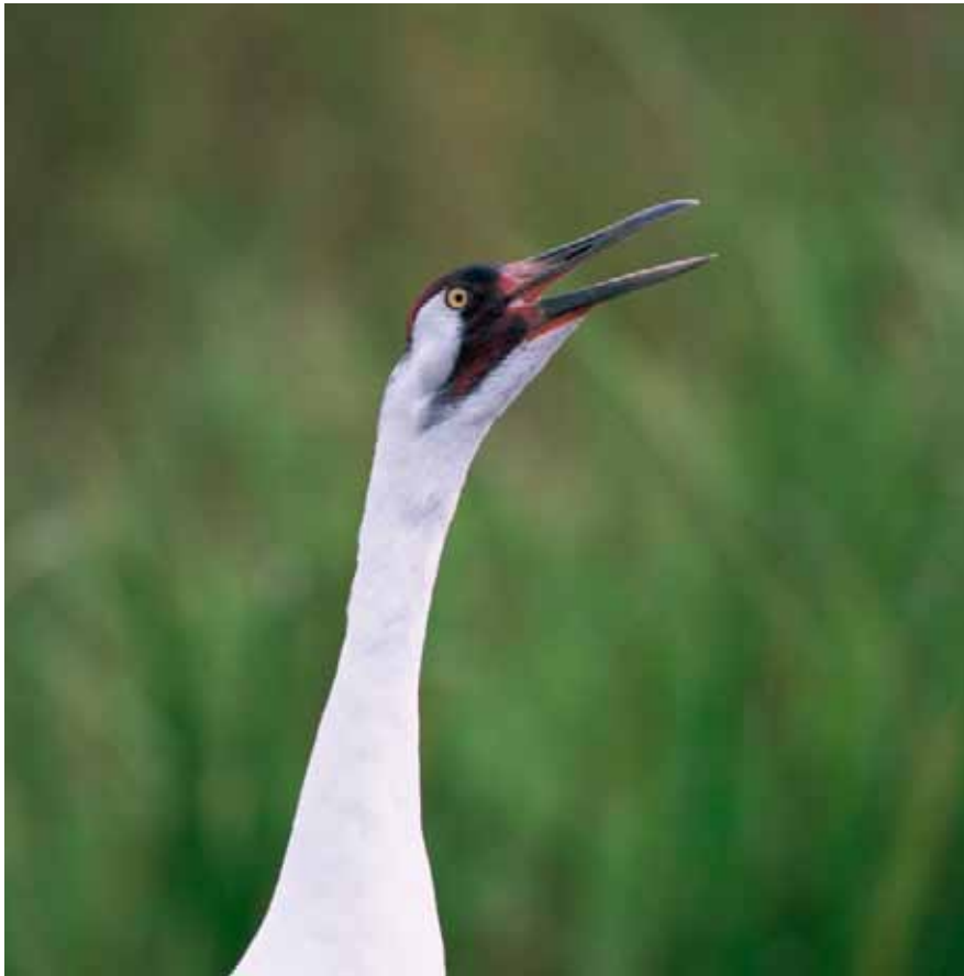
Whooping crane.

and relative abundance require coverage of the wind turbine sites and applicable site disturbance area, or a sample of the area using observational methods for the species of concern during the seasons of interest. As with presence/absence (see Tier 3, question 1, above) the methods used to determine distribution, abundance, and behavior may vary with the species and its ecology. Spatial distribution is determined by applying presence/absence or using surveys in a probabilistic manner over the entire area of interest. Suggested survey protocols for