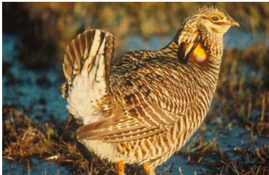
Attwater's prairie chicken.

Some areas may be inappropriate for large scale development because they have been recognized according to scientifically credible information as having high wildlife value, based solely on their ecological rarity and intactness (e.g., Audubon Important Bird Areas, The Nature Conservancy portfolio sites, state wildlife action plan priority habitats). It is important to identify such areas through the tiered approach, as reflected in Tier 1, Question 2 below. Many of North America's native landscapes are greatly diminished, with some existing at less than 10 percent of their pre-settlement occurrence.