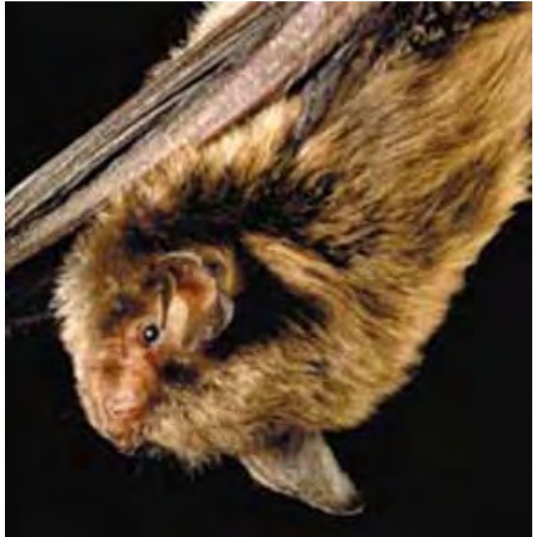
Indiana bat.

The Endangered Species Act (16 U.S.C. 1531–1544; ESA) was enacted by Congress in 1973 in recognition that many of our Nation’s native plants and animals were in danger of becoming extinct. The ESA directs the Service to identify and protect these endangered and threatened species and their critical habitat, and to provide a means to conserve their ecosystems. To this end, federal agencies are directed to utilize their authorities to conserve listed species, and ensure that their actions