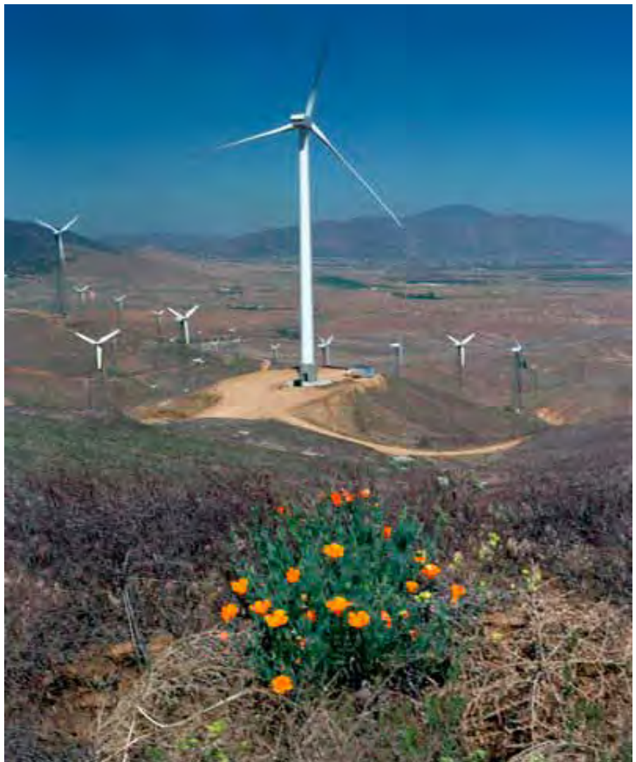
Wind turbines and habitat.

Impacts of a project will have population level effects if the project causes a population decline in the species of concern. For non-listed species, this assessment will apply only to the local population.