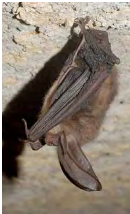
Virginia big-eared bat.

post-construction data in the areas of interest and reference areas is possible, then the Before-After-Control-Impact (BACI) is the most statistically robust design. The BACI design is most like the classic manipulative experiment. 6 In the absence of a suitable reference area, the design is reduced to a Before-After (BA) analysis of effect where the differences between pre- and post-construction parameters of interest are assumed to be the result of the project, independent of other potential factors affecting the assessment area. With respect to BA studies, the key question is whether the observations taken immediately after the incident can reasonably be expected within the expected range for the system (Manly 2009). Reliable quantification of impact usually will include additional study