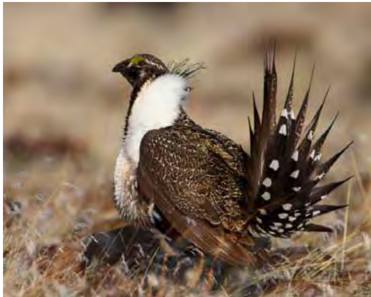
Greater sage grouse